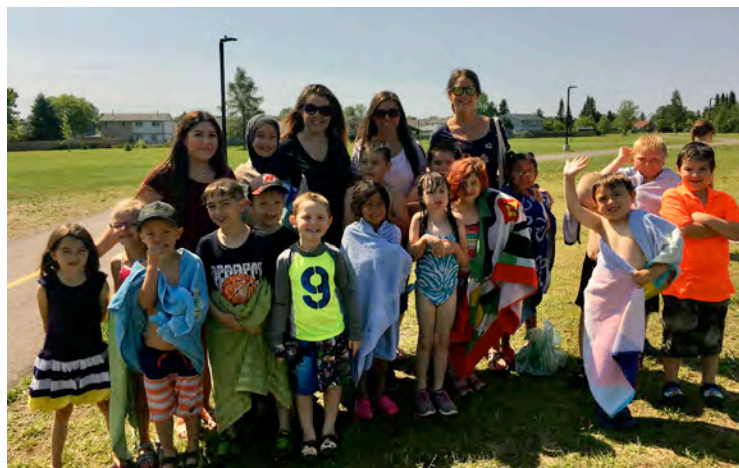
2017 Summer Literacy Program Students

Throughout the program, students were encouraged to participate in reading, writing, open discussions and independent thinking. In addition, Speech Language Pathologists worked directly with Kindergarten children in small groups each day. Grades 1 - 3 children enjoyed developing Coding and Robotics skills.